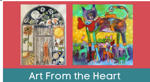
Art From the Heart